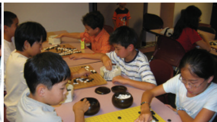
Above left: Players attend the Rockville, Md., Go and Chess Club. Above right: Kids get their game on at the Boulder Kids & Teens Go club.