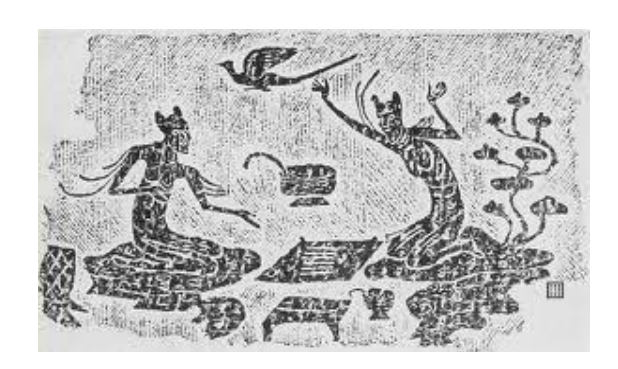
Two Immortals caught up in a frantic game of liu bo

Moreover, it seems unlikely that these writers would use a game the Confucians condemned for the drinking and gambling that it inspired, as a look at the Wikipedia article or its appearance along with the sing-song girls in the wild party of the 4th century BC poem The Summoning of the Soul will testify to. If the writers of the Mencius frowned on such unfettered non-ritual behavior, why would they use liu bo as an exemplar in the second passage? It would certainly confuse readers! (4)